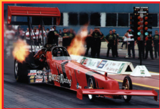
The Top Fuel Hartley Racing car accelerates down the track.

Allen owns and races a Top Fuel Dragster, sanctioned under the National Hot Rod Association, in races around the country. His car accelerates at about 4.5 to 5 g forces and generates about 6000 - 7000 horsepower running on nitro-methane. The cars cover a quarter of a mile in 4.5 seconds at a speed of 335 mph.