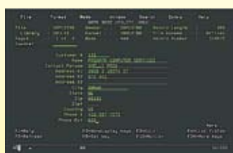
DBU 6.0 Traditional Green